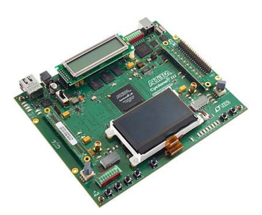
Figure 2 shows the data conversion HSMC.